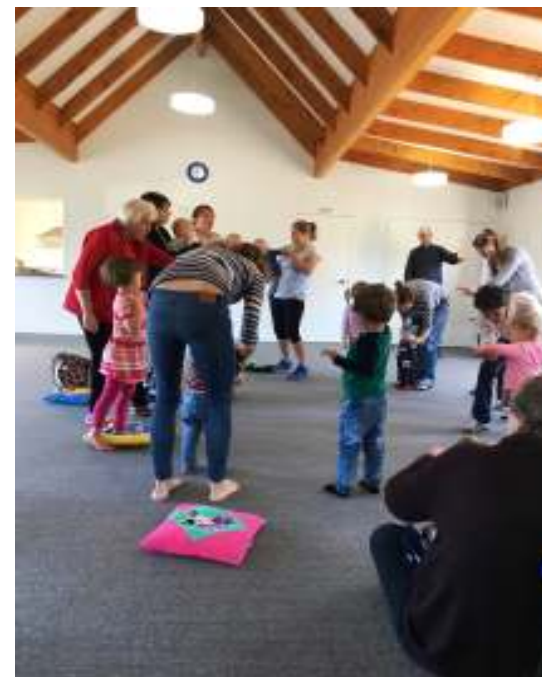
Rhythm 'n' Riggle Pre-School Music Group