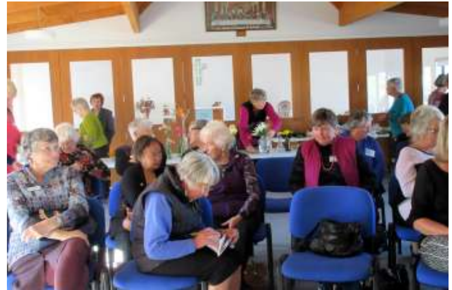
Kaiwaka-Mangawhai Garden Club