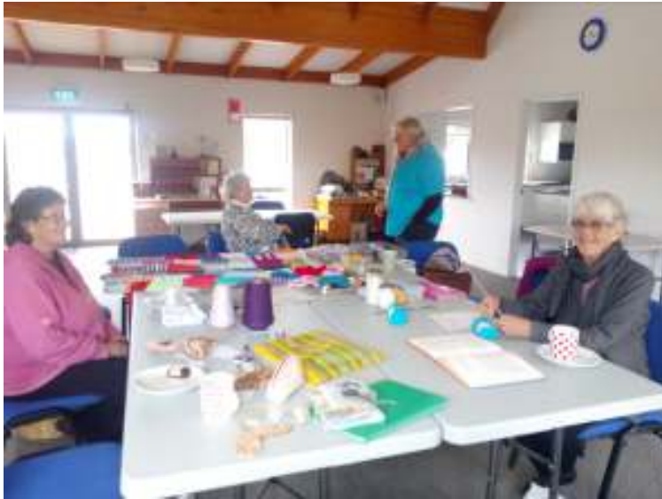
C+K's Craft Group