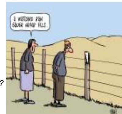
A watched rain gauge never fills