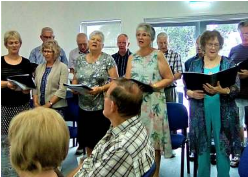
Mangawhai Singers at Christ the King Church