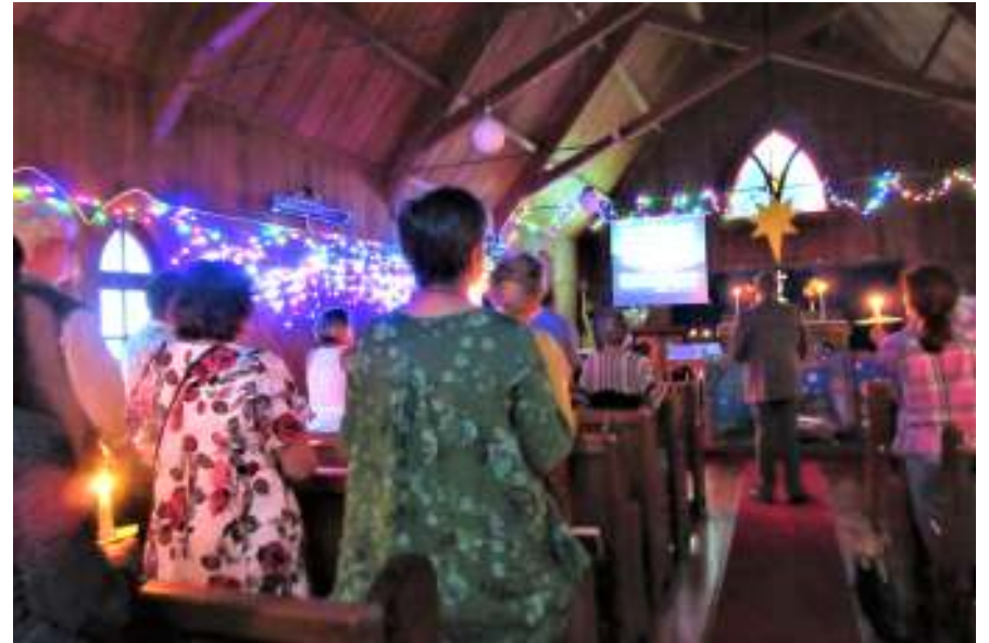
Carols by Candlelight - St Paul's Church, Kaiwaka