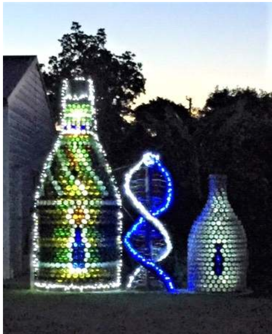
Neville Dowson's illuminated bottle creations