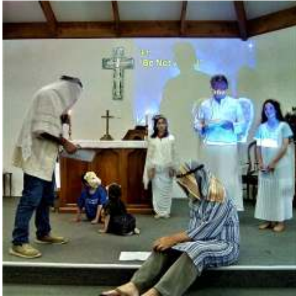
Christmas Services 2019