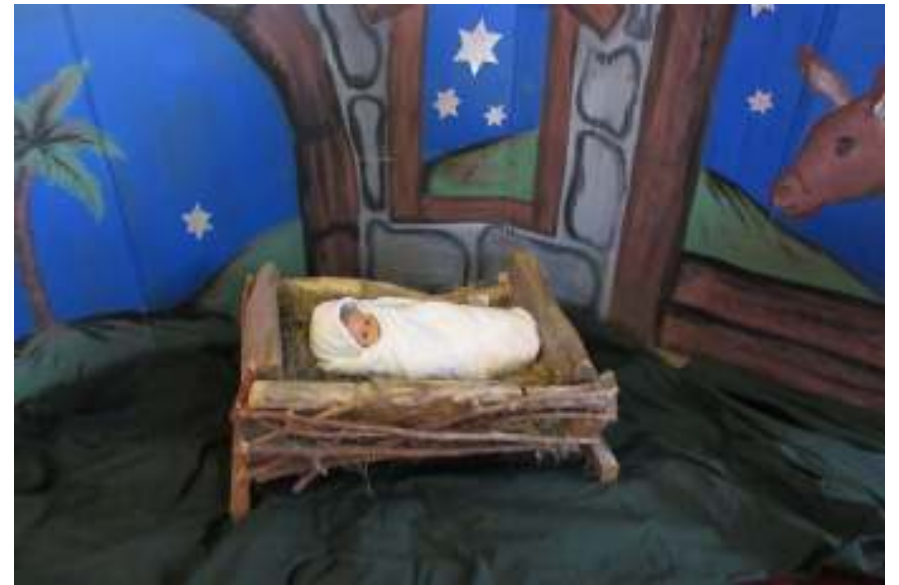
Nativity Scene - St Paul's