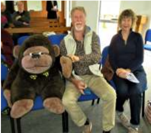
St Francis Animal Blessing Service