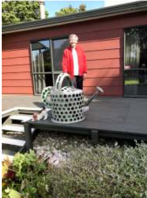
Watering Can Raffle Winner