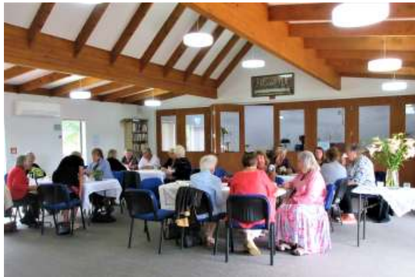
Kaiwaka-Mangawhai Garden Club Christmas Afternoon Tea